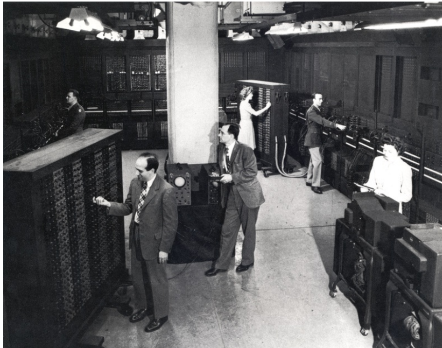
ENIAC (circa 1948)

Until 1923, the Council was the only governing body of the AMS. In that year, the AMS was incorporated (in the District of Columbia) and the Board of Trustees was added to look after the financial affairs of the Society. The Society headed into a quarter-century of steady operations – regular meetings, the Bulletin and Transactions , an occasional book. The depression took its toll on the AMS (revenues were flat for the decade of the 1930s) and not much changed until the War. Then, everything changed. Mathematics became important, disputes broke out between pure and applied mathematicians, and in the aftermath of the war, people recognized that science and mathematics played a new role in the country's future. There was much acrimony about pure versus applied, both during the War and afterwards. This was the time when the Society for Industrial and Applied Mathematics was formed, along with applied mathematics departments at several universities. It was a dark period for mathematics that affected attitudes for decades afterwards, and many of the wounds are still healing.