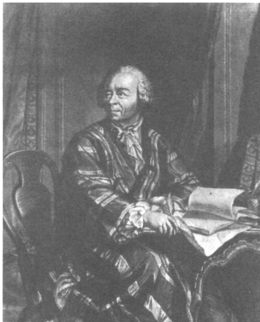
Portrait of the mature Euler

ness to be beaten serves, in the truest sense of the word, as an inspiration for mathematician and non-mathematician alike. The long history of mathematics provides no finer example of the triumph of the human spirit.