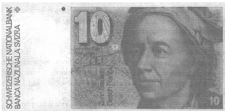
Euler on Swiss currency

made, for I turned most of my time to mathematical studies, and by my happy fortune the Saturday visits to Johann Bernoulli continued. 3