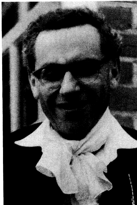
Paul Erdős (1913–1996)