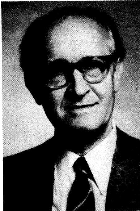
Paul Turán (1910–1976)