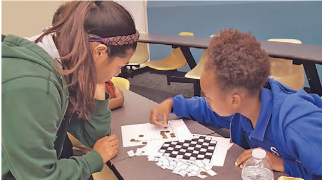
A CHAMP volunteer working with a student at an in-school CHAMP meeting.

flexibility in determining activities and approaches. It also gave Tomforde the ability to focus his time and energy on identifying enthusiastic volunteer instructors and tutors to work one-on-one with the small groups of students from local schools.