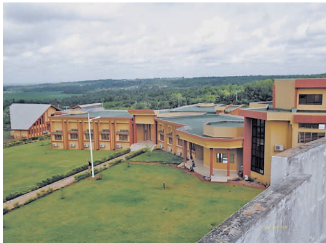
Figure 1: Pictured here is the Institut de Mathématiques et Sciences Physique (IMSP) in Benin. A small graduate school in mathematics that recruits students from all over Africa, IMSP recently won a World Bank award to host a “center of excellence.”

of Botswana, University of Dakar, Universities of Yaounde and Dschang in Cameroon, University of Niamey in Niger, and University of Congo-Brazzaville. I have also visited AIMS Senegal, where I gave lectures and seminars and directed master's theses.