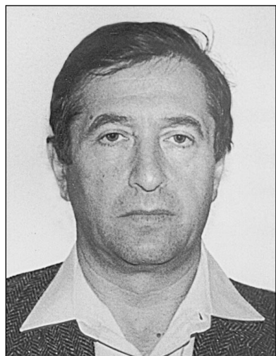
Yakov G. Sinai

Keller was born in 1923 in Paterson, New Jersey. He received his B.A. in physics in 1943, his M.S. in physics in 1946, and his Ph.D. in mathematics in 1948, all from New York University. He was on the faculty of the Courant Institute of Mathematical Sciences at NYU until 1979. He was a visiting professor at Stanford during 1969–1970 and 1976–1978 before moving there permanently in 1978. He was a