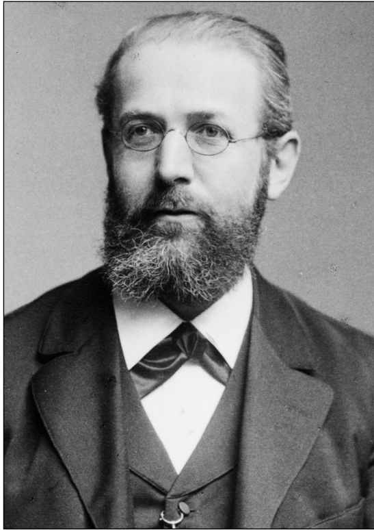
Ferdinand Georg Frobenius.

nant in terms of |G| -th roots of unity was well known to nineteenth-century mathematicians.