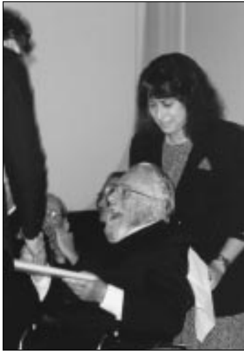
Receiving the AMS Leroy P. Steele Prize, Baltimore, 1998.