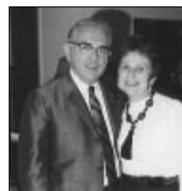
With wife Florie, around 1960.