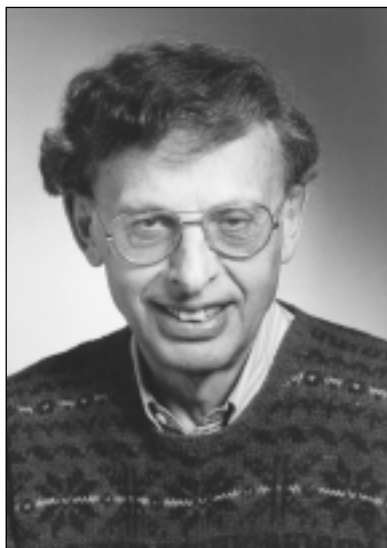
Elias M. Stein

On May 9, 2002, President Bush awarded fifteen National Medals of Science. Among the awardees were two mathematical scientists, CALYAMPUDI R. RAO, emeritus holder of the Eberly Family Chair in Statistics and director of the Center for Multivariate Analysis at Pennsylvania State University, and adjunct professor at the University of Pittsburgh; and ELIAS M. STEIN, Albert Baldwin Dodd Professor of Mathematics at Princeton University.