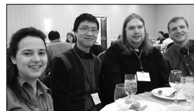
AMS Travel Grant recipients at the Joint Mathematics Meetings

—Graduate student, AMS Travel Grant recipient