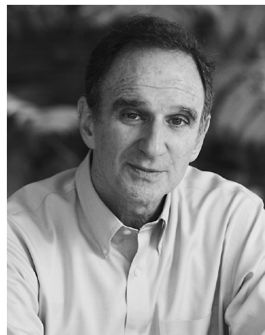
Martin E. Hellman

WHITFIELD DIFFIE, former chief security officer of Sun Microsystems, and MARTIN E. HELLMAN, professor emeritus of electrical engineering at Stanford University, have been awarded the 2015 A. M. Turing Award of the Association for Computing Machinery for their critical contributions to modern cryptography.