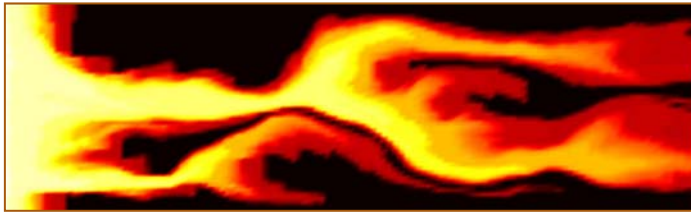
Figure 2. Simulation of carbon dioxide injection (from the left) into a two-dimensional reservoir on a computer. Yellow indicates 100% gas and black 100% oil. The gas flows through the rock. Since it prefers the paths of least resistance

(high permeability paths) it is seen to “finger through” the domain. Where it goes, the oil is swept out of the pore space and produced (on the right).