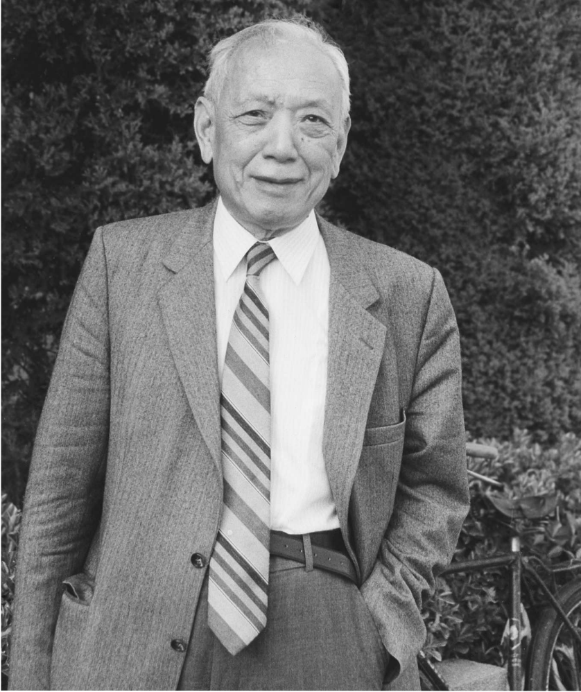
Shiing-shen Chern, 1911–2004