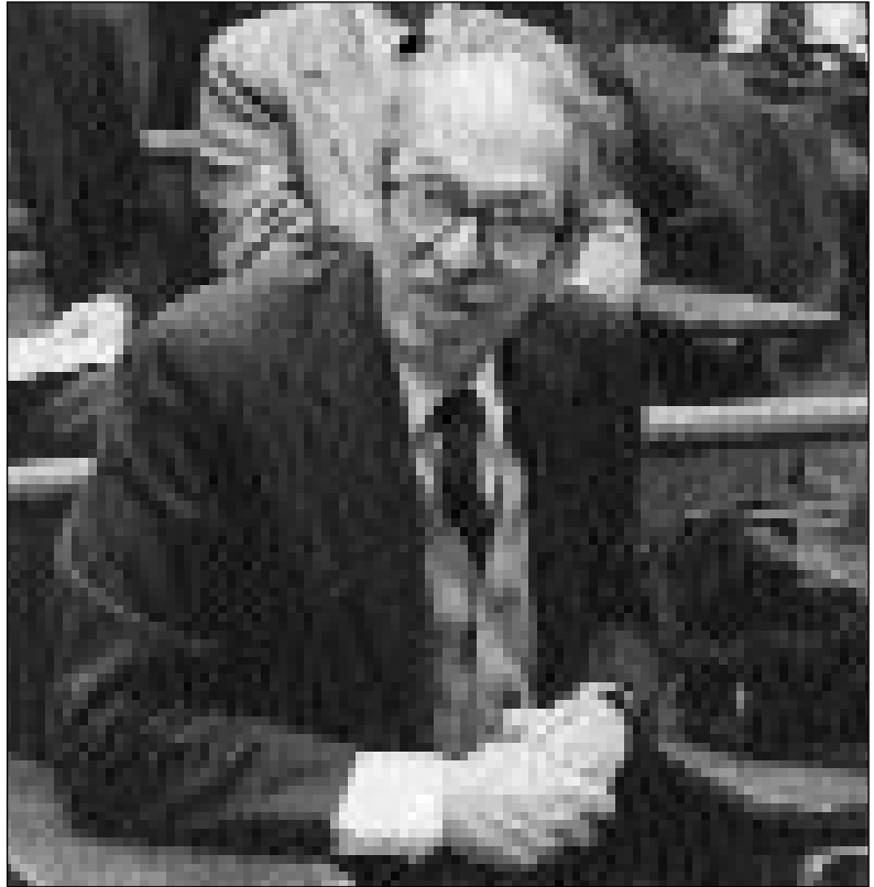
Lipman Bers at Columbia University in 1984.

which is defined in the whole complex plane must be linear. There are standard techniques that reduce the study of the minimal surface equation to the linear equation