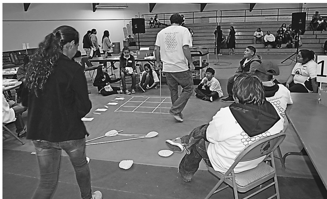
A day at the festival, in pictures. From the top down: 1. Participants; 2. Counting tree rings; 3. Ballast puzzles; 4. Life-size counting problems.

by more mathematicians, teachers, and students in many other places in this country and beyond.