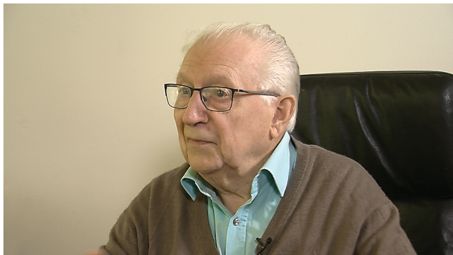
Interview with Michel Raynaud.