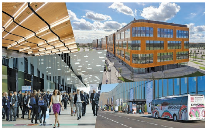
Figure 2. Views of the Expoforum convention and exhibition centre.

and natural beauty, the treasures of its museums, the expression and perfection of its musical performances, and so many other things that attract millions of visitors every year. Many visitors come to take part in international congresses and conventions—St. Petersburg is a leading destination for international gatherings, hosting such high profile events as its annual international economic (SFIEF) and legal forums. The city is used to extending its warm hospitality on a really large scale: it hosted several games of the soccer World Cup in 2018 and will be welcoming soccer fans again for UEFA Euro 2020.