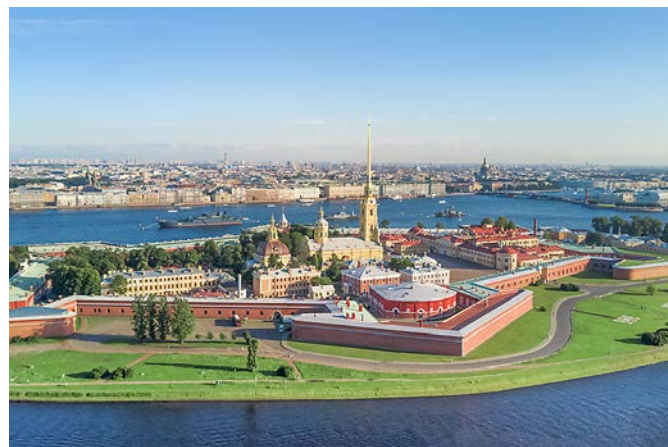
Figure 3. View of Saint Petersburg: the Peter and Paul fortress, the Neva River, the Winter palace (the Hermitage museum), and the Saint Isaac's cathedral in the background.

Frequent special buses will bring ICM participants to the subway (15 min) and to the city center (about 30 min). The trip to the city center goes via one of the city's main arteries—Moskovsky Prospekt. Along it, many more hotels are situated, making for convenient pickup and dropoff. The connection from the Expoforum to the Pulkovo International Airport is particularly easy and takes only a few minutes. Pulkovo has recently completed a large-scale upgrade and was recognized in 2015 as Europe's best airport. There will be people there to help ICM participants and no lines. Other convenient arrival options include high-speed trains and cruise ships.