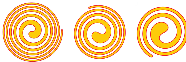
Figure 2. A nonconvex ancient solution to curve shortening flow at times t_1 < t_2 < t_3 . Shots from a video created by Sigurd Angenent.

In [10] the authors jointly with Hamilton showed that the only ancient embedded closed convex solutions to the curve shortening flow in \mathbb{R}^2 are either the family of contracting circles or the Angenent ovals .