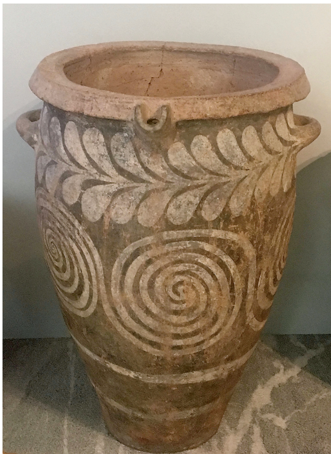
Figure 1. The image on an ancient vase from Minoan Crete dated 1500–2000 BC resembles an ancient solution to curve shortening flow (see Figure 2).

of parabolic partial differential equations describing diffusion of heat in a solid medium. However, the Ricci flow is a nonlinear system of equations, and depending on the initial metric it is likely to develop singularities in finite time. A special approach with new techniques needed to be introduced to carry out Hamilton's idea.