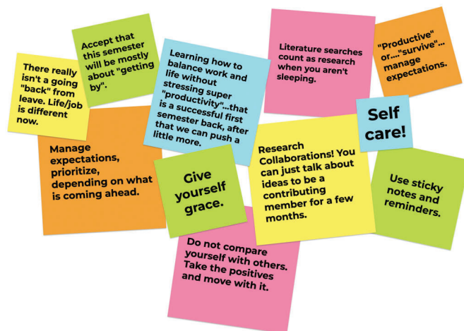
Figure 2. A subset of suggestions we received when we asked, “It’s your first semester back from leave: what are strategies to stay productive this semester?”

During the workshop, we sought to collectively brainstorm ideas that individuals could use “out of the box” as mathematicians navigating parenthood. Here we summarize tips from our panel discussion and breakout sessions.