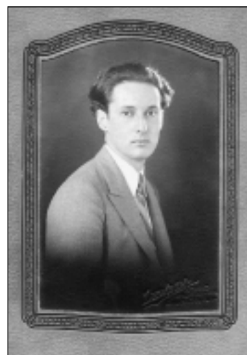
... as a young man in Chicago in the late 1920s...