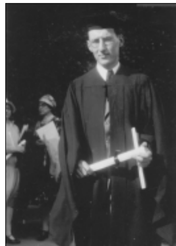
... as a new Ph.D. at the University of Chicago, 1931.