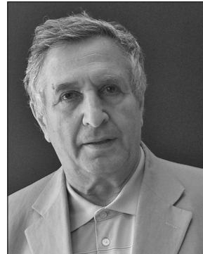
Yakov G. Sinai

Sinai's research exhibits a unique combination of brilliant analytic technique, outstanding geometric intuition, and profound understanding of underlying physical phenomena. His work highlights deep and unexpected connections between dynamical systems and statistical mechanics.