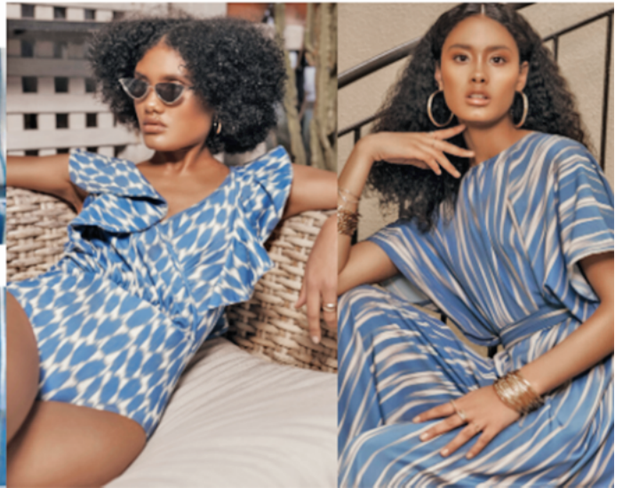
Figure 3. The Kailua and Waimea prints in DIARRABLU's Spring/Summer 2020 collection are derived from the label's bestselling Sokhna print via dilation.

one that results from “an innovative celebration of math concepts such as Euclidean geometry, combinatorics and recursion.”