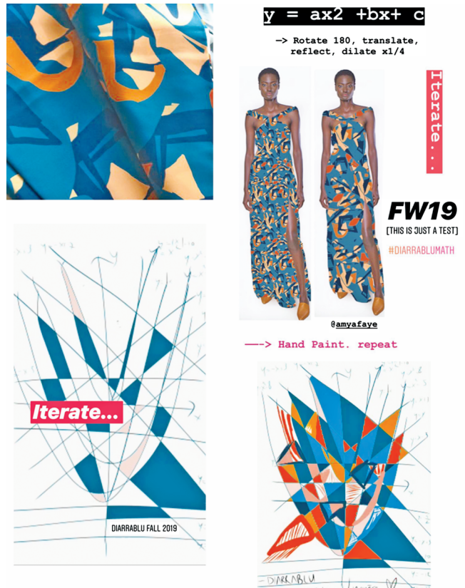
Figure 1. DIARRABLU’s Fall 2019 collection signalled a new direction for the label: designing prints with mathematics.

the math classroom to the garment.” Fashion enthusiasts turned out, yes, but math professors (Jo Boaler, for one: see Figure 2) and students, too—a real meshing of Bousso’s two worlds. As 2019—DIARRABLU’s most successful year to date—drew to a close, media requests rolled in from the likes of Forbes and Vogue , CNN and Reuters. But for all the press attention, it was the engagement of her students with her work that Bousso found most gratifying. Members of Bousso’s Algebra II and Geometry classes attended the Bloomingdale’s exhibition and explained the math behind the designs. “It was so encouraging and humbling for me,” she says.