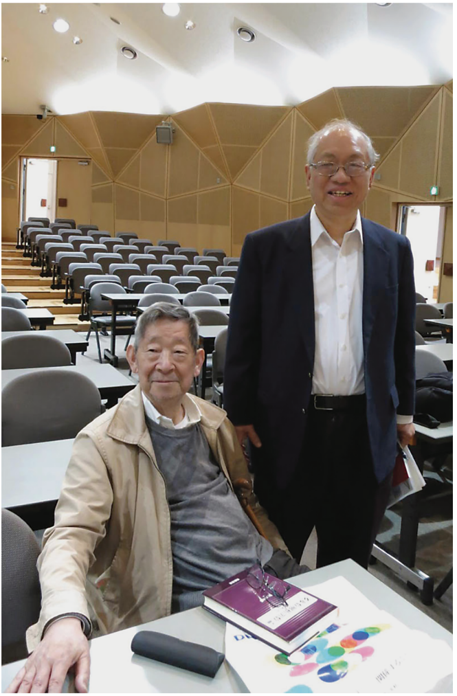
Figure 16. Kuranishi and S.-T. Yau.

positive sectional curvature. This took me by surprise. The paper was over 150 pages. Despite it being full of original ideas, it fell through eventually. But he treated the whole process in the most graceful way, and I am grateful for it.