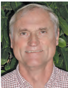
Richard M. Schoen

RICHARD M. SCHOEN of the University of California Irvine has been awarded the 2017 Lobachevsky Medal and Prize for Outstanding Work in Geometry and Its Applications. The prize carries a cash award of US$75,000. He was honored for his work in differential geometry. According to the prize citation, “he holds fundamental theorems on positive energy in the general theory of relativity, he obtained a complete