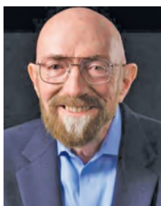
Kip S. Thorne

The Royal Swedish Academy of Sciences has awarded the 2017 Nobel Prize in Physics to RAINER WEISS, BARRY C. BARISH, and KIP S. THORNE, all of the LIGO/Virgo Collaboration, for their “decisive contributions to the LIGO detector and the observation of gravitational waves.” Weiss receives one-half of the prize; Barish and Thorne share one-half.