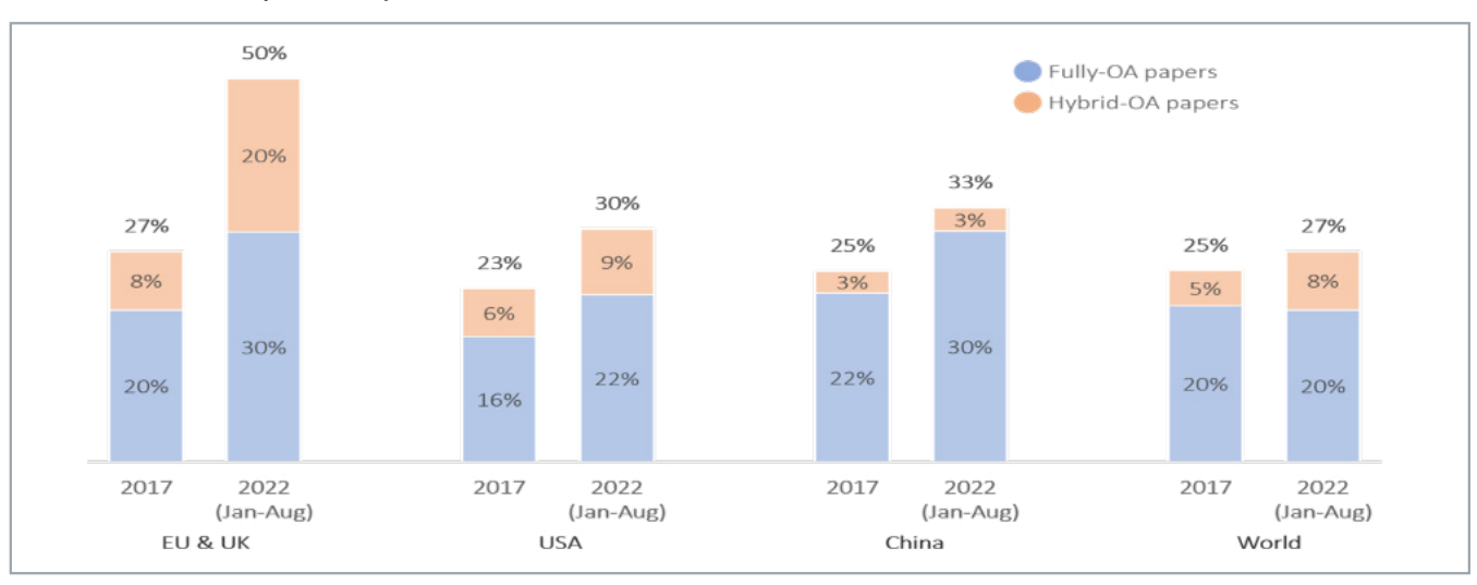
Gold-OA uptake by region. Articles and Review Articles per the Web of Science (SCIE, SSCI, AHCI, and ESCI indexes)

The chart below shows that the EU and the UK publish 50% of their papers in a Gold-OA format. Europe's performance places it well ahead of the USA and China, which publish 30% and 33% of their content, respectively, in a Gold-OA format.